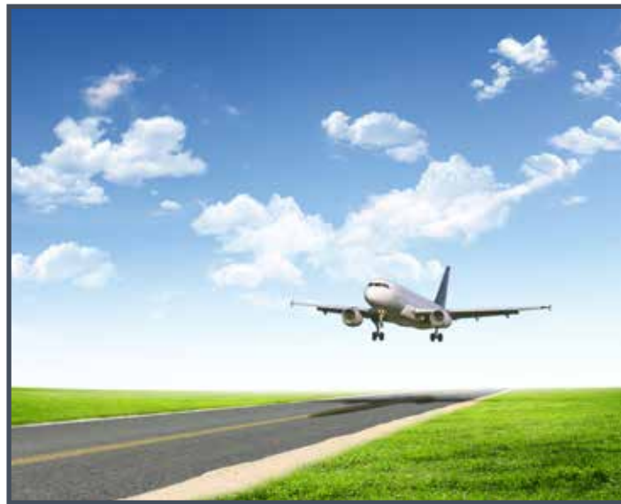
Privatization advocates are pushing for the sale of all kinds of public assets, including water and sewer systems and other major pieces of the nation's transportation infrastructure, from airports to the air traffic control system itself. These deals are promoted with the same assumptions about the inherent superiority and efficiency of private operations over public ones, even though there are plenty of counterexamples.

In May 2011, during the debt-ceiling showdown, Ron Utt, who promotes privatization from his perch at the right-wing Heritage Foundation, called for the United States to sell its gold reserves to raise money for deficit reduction, an idea that an Obama administration official called "just one level of crazy away from selling Mount Rushmore."