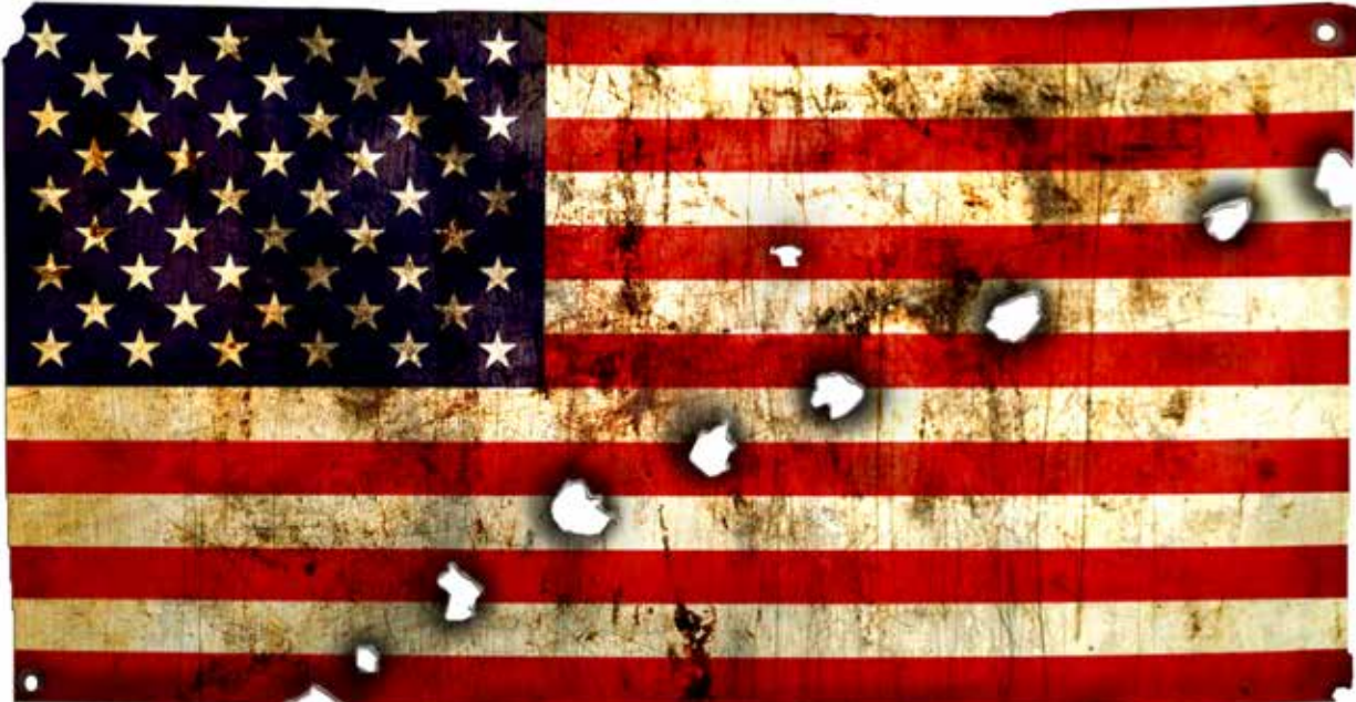
The politicians and corporate interests that promote the notion of greedy public servants are, of course, the same ones working to keep pay and benefits low in the private sector. They back policies that ship jobs overseas (another part of the ALEC “free trade” agenda) and keep wages low at home, then try to stir resentment among low-wage workers toward public employees whose wages can support a middle-class family.

One problem that could end up costing the state much more: State food service employees are now trained to help respond to incidents requiring security. Their contractor replacements, however, would be pulled out in the case of