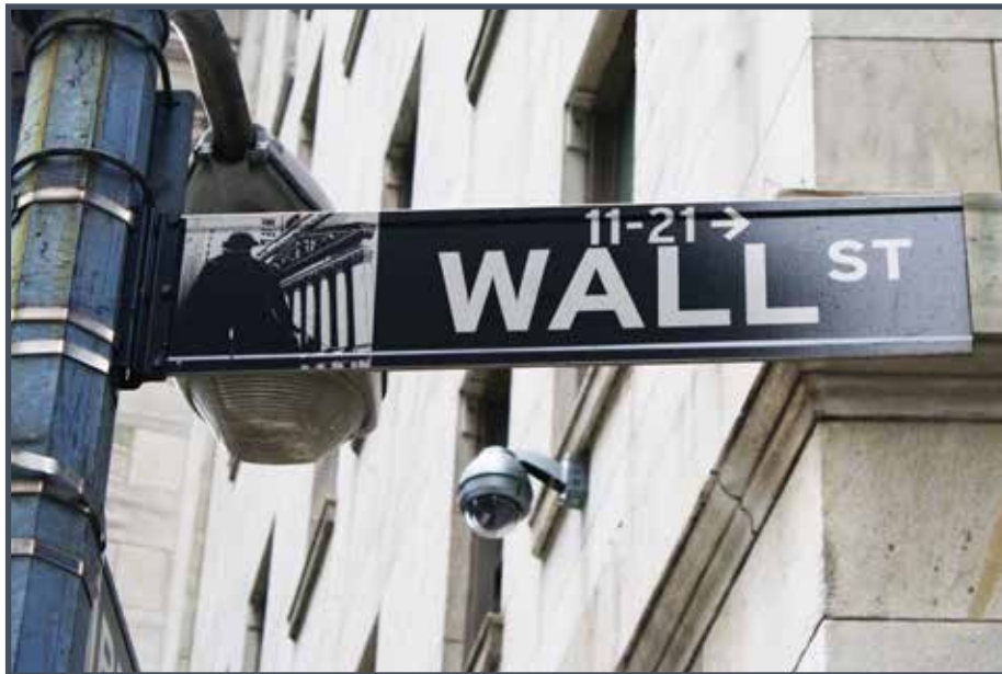
There’s good reason investors want in on public assets like toll roads: “Most assets are monopolistic in nature and have limited competitors, creating the opportunity for stable, long-term investment returns,” says Quadrant Real Estate Advisors. “Infrastructure investments are attractive to many investors because they are part of essential services and offer predictable cash flows,” writes an analyst for onwallstreet.com.